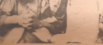
WORK, FRIENDS AND FOES